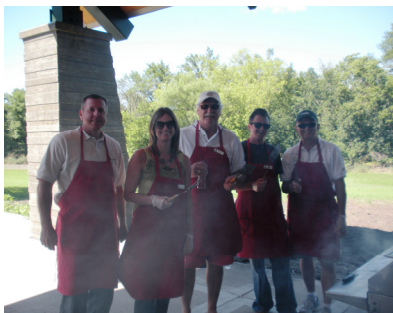
Left: Some of the Access Board Members, helping to grill the hotdogs and hamburgers.